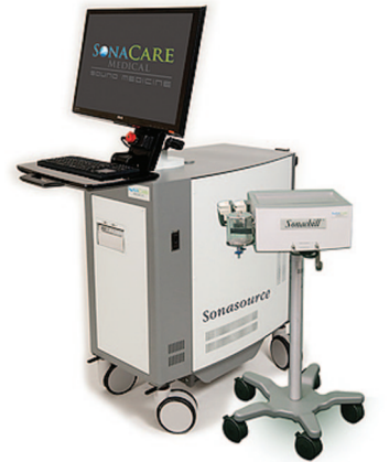
Sonablate HIFU device